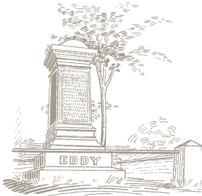
Town of Eddington · February 22, 1811

Eddington Town Office 906 Main Road Eddington, ME 04428