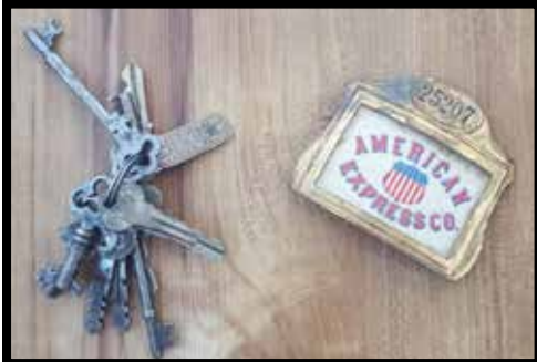
Right out of school, Roland got a job at American Express in Bangor unloading railway cars. A popular item for delivery in the Bangor area was the pre-numbered Sears Roebuck bungalow kit.