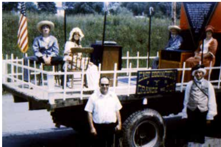
Grange float in Eddington parade American Revolution Bicentennial 1976