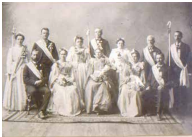
1900 East Eddington Grange 301 Degree Team

The Grange was a national organization founded by a Midwesterner, Oliver Hudson Kelly, and some of his friends who wanted to improve the quality of rural life.