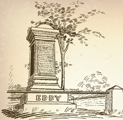
Town of Eddington · February 22, 1811