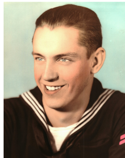
March 20, 1934 – January 30, 2015