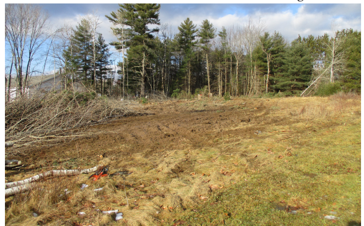
Lot being cleared